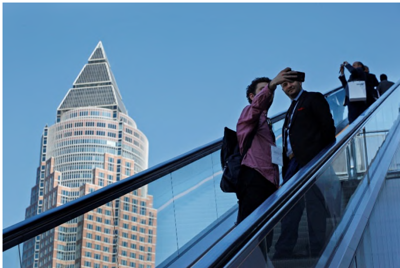
Frankfurt am Main: Home of the ELA 2022 Global Assembly and Annual Conference on May 19 + 20, 2022.

The political, ecological and economic framework relevant for the future strategies of the elevator and escalator industry is on the agenda of the General Assembly and Annual Conference 2022, which the European Lift Association (ELA) is holding in Frankfurt am Main on 19 and 20 May 2022.