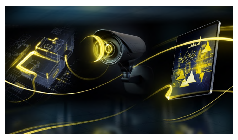
In future-proof buildings, systems work interoperably and can be expanded and adapted as required. The 'Connectivity' theme focuses on digitalisation, networking, safety and security.

The 'Connectivity' theme also contributes to the efficient use of resources. Thus, electrification and digitalisation are the basis for successfully interconnecting the various disciplines of the smart home and the smart building and, in the product life cycle of a building, begins at the planning stage using Building Information Modelling (BIM). The collection and storage of data makes it possible to control and maintain the functions of a building efficiently during use, resulting in a higher level of comfort and, in particular, greater safety and security.